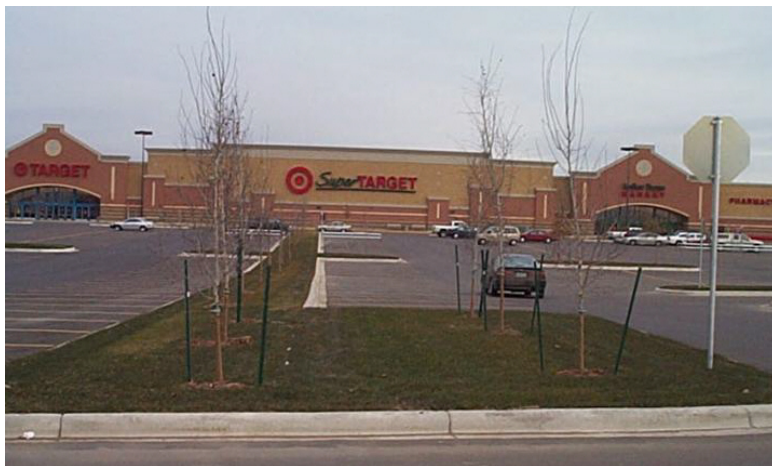
Super Target, Minnesota

The purpose of this project is to provide large building and site footprint high volume retailers with strategies that integrate innovative and highly effective Low Impact Development (LID) stormwater management techniques into their site designs for regulatory compliance and natural resource protection at the local levels. LID is an innovative approach to stormwater management that uses decentralized, or source, controls to replicate pre-development hydrology (stormwater) conditions. This approach can be used as an alternative or enhancement for conventional end-of-pipe stormwater pond technology. This alternative tool is important because of the potential to lessen the energy impacts of large concentrated volumes of runoff from conventional end-of-pipe approaches on receiving waters as well as reducing the development footprint and long-term maintenance considerations for end-of-pipe facilities.