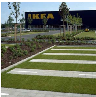
IKEA Parking Lot